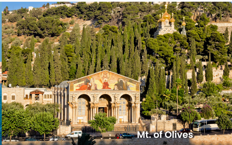
Mt. of Olives